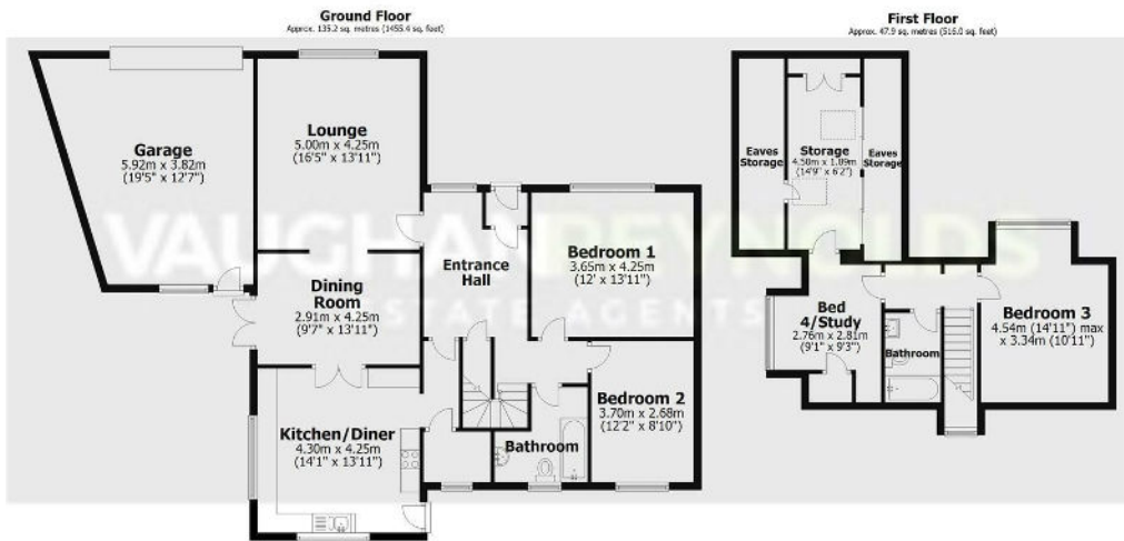
Total area: approx. 183.2 sq. metres (1971.5 sq. feet) This plan is for layout guidance only and not drawn to scale unless stated. Window and door openings are approximate. All room sizes are taken in preparation of this plan, please check all dimensions and shapes before making any decisions related upon them. (See structural survey details)

VaughanReynolds, for themselves and for the vendors of the property whose agents they are, give notice that these particulars do not constitute any part of a contract or offer, and are produced in good faith and set out as a general guide only. The vendor does not make or give, and neither VaughanReynolds nor any person in their employment, has an authority to make or give any representation or warranty whatsoever in relation to this property.