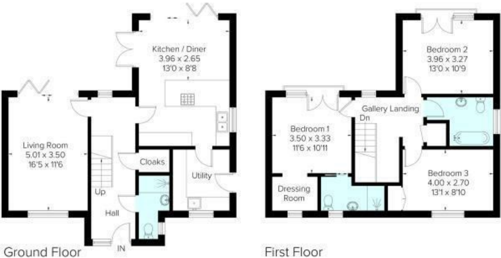
Drawn for illustration and identification purposes only by fourwalls-group.com 227868

Approximate Floor Area = 129.7 sq m / 1396 sq ft