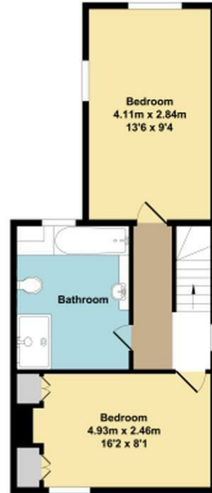
1st Floor Approx. Floor Area 41.76 Sq.M. (450 Sq.Ft.)