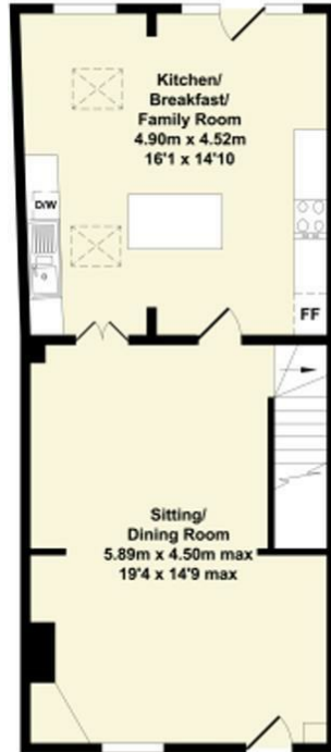
Ground Floor Approx. Floor Area 50.68 Sq.M. (546 Sq.Ft.)

Whilst every attempt has been made to ensure the accuracy of the floor plan contained here, measurements of doors, windows, rooms and any other items are approximate and no responsibility is taken for any error, omission, or mis-statement. This plan is for illustrative purposes only and should be used as such by any prospective purchaser. The services systems and appliance shown have not been tested and no guarantee as to their operability or efficiency can be given