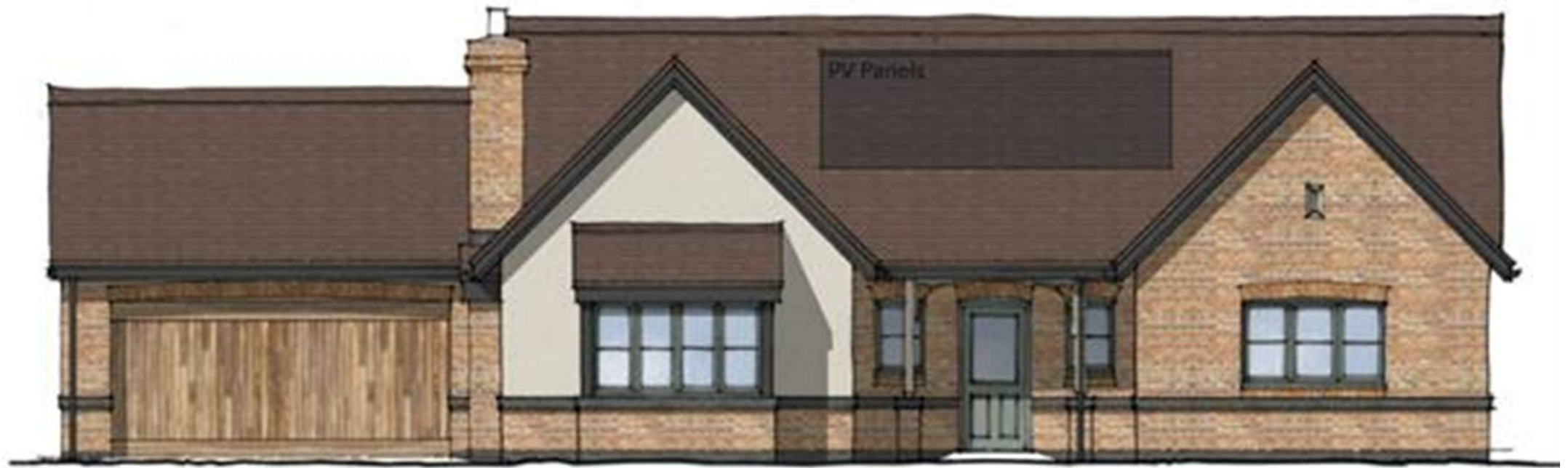
Proposed Front Elevation Scale 1:50