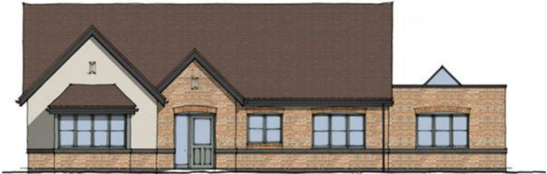
Proposed Front Elevation Scale 1:50