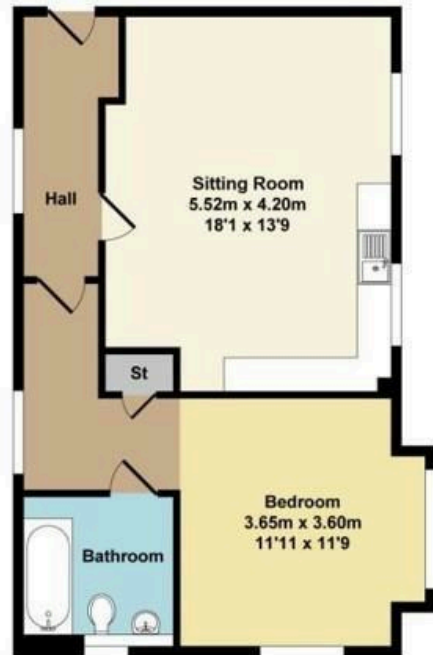
First Floor Approx. Floor Area 51.10 Sq.M. (550 Sq.Ft.)

Whilst every attempt has been made to ensure the accuracy of the floor plan contained here, measurements of doors, windows, rooms and any other items are approximate and no responsibility is taken for any error, omission, or mis-statement. This plan is for illustrative purposes only and should be used as such by any prospective purchaser. The services, systems and appliances shown have not been tested and no guarantee as to their operability or efficiency can be given.